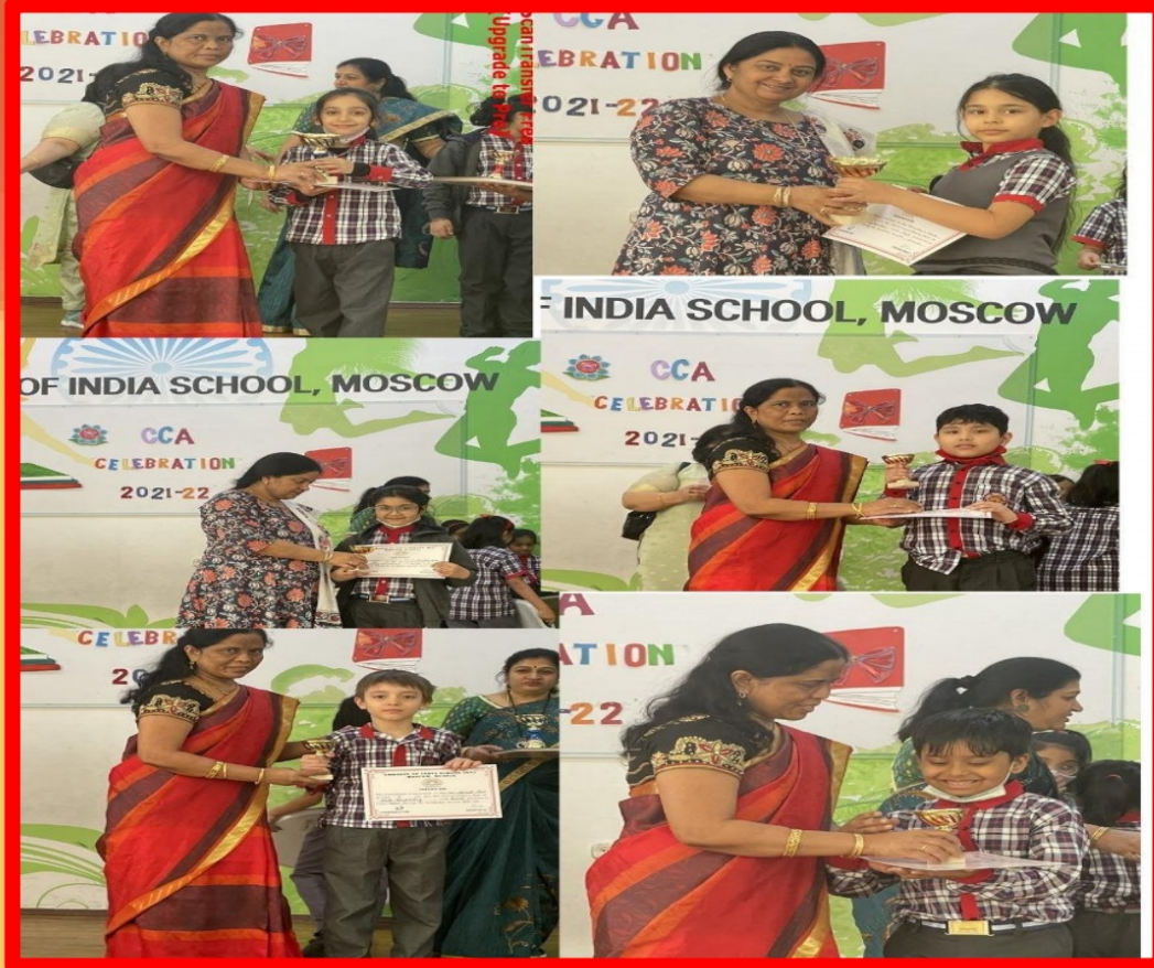
PRIZE DISTRIBUTION CLASS II

EVERY - accomplishment - STARTS WITH the DECISION TO TRY