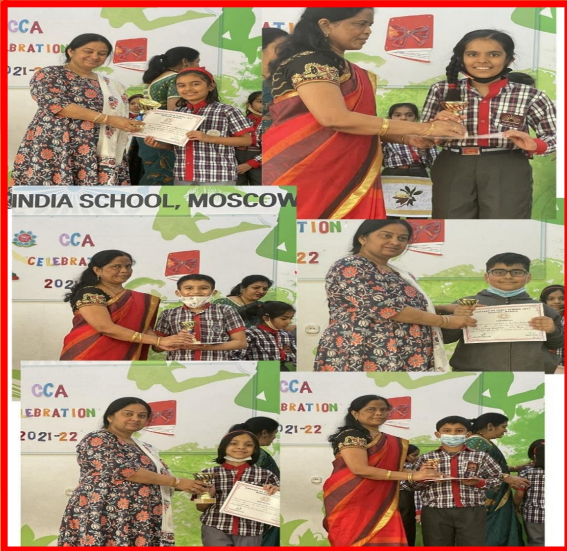
PRIZE DISTRIBUTION CLASS III