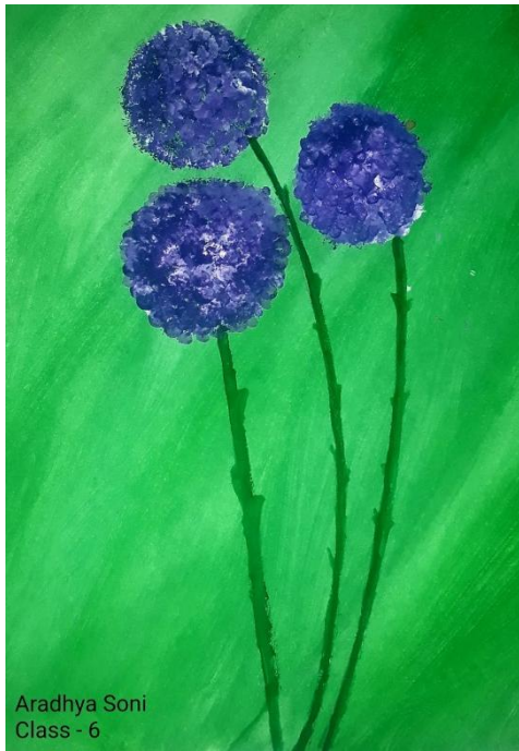
Aradhya Soni Class - 6