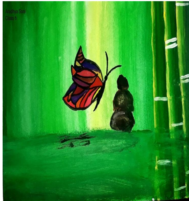
Aradhya Soni Class 6