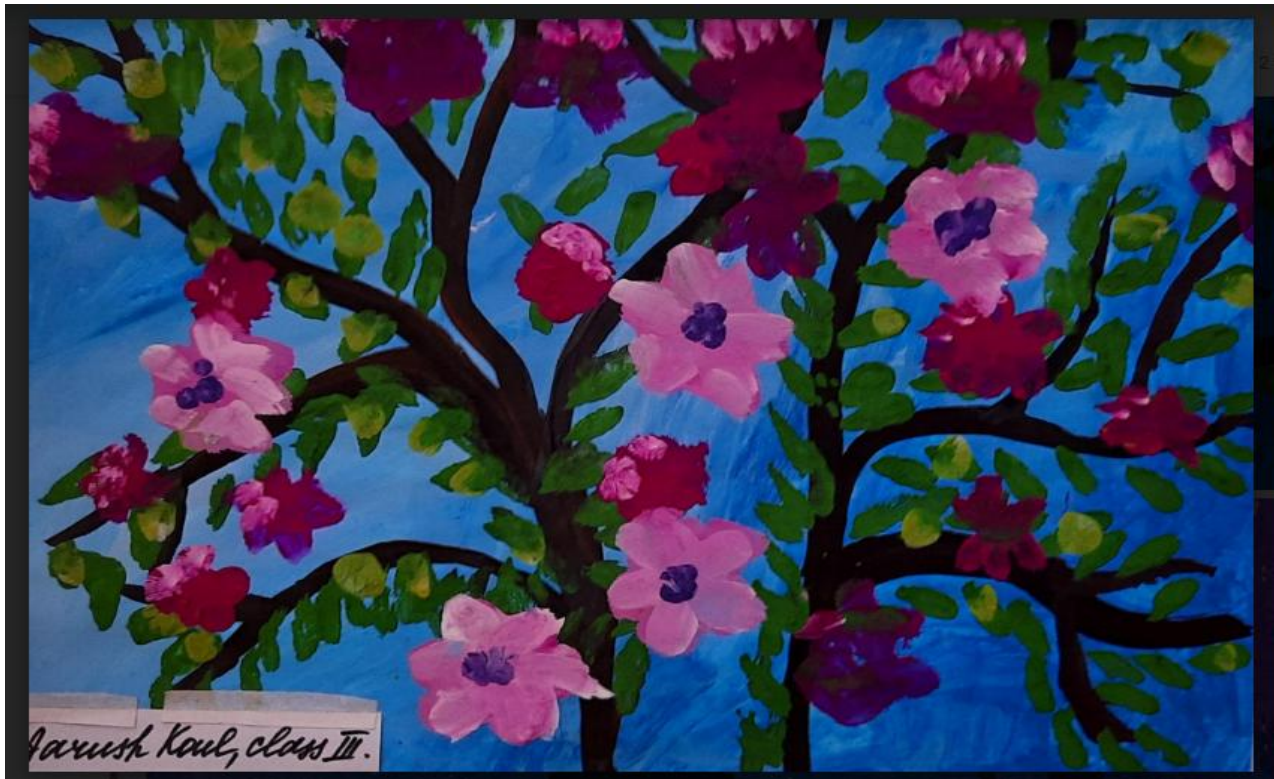
Aarush Koul, class III.